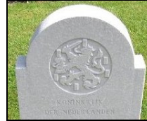
KONINKRIJK DER NEDERLANDEN

11. Three non-militaries are buried on this cemetery (row 23). Search one of them and write down his name and age.